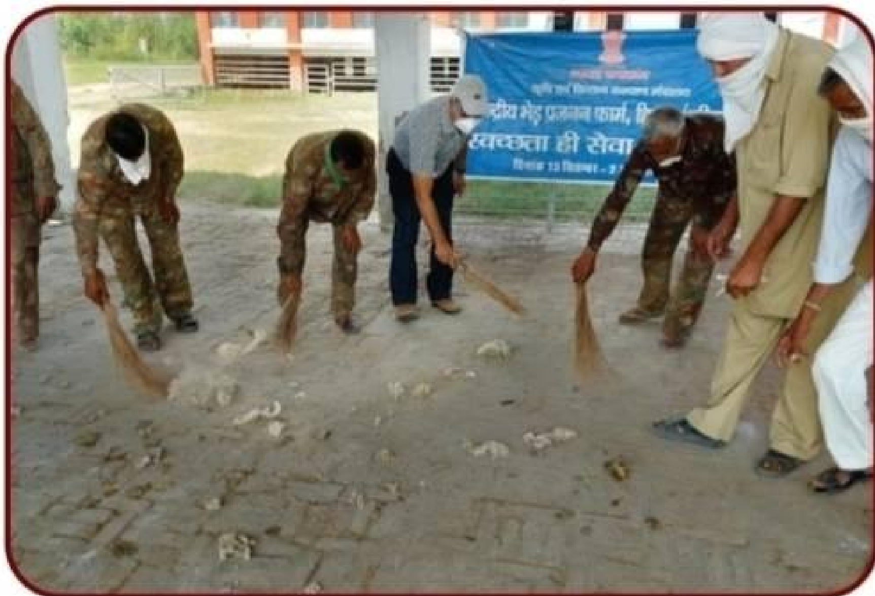
Swachhta activities at CSBF, Hisar on 02nd October 2020.