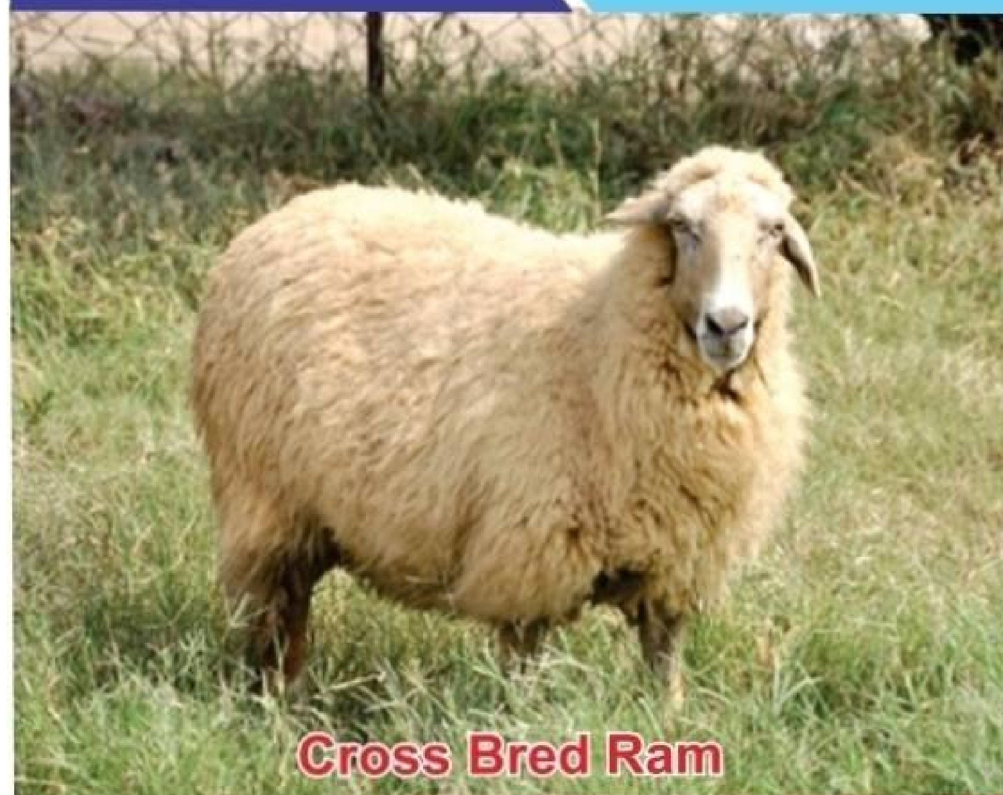
Cross Bred Ram