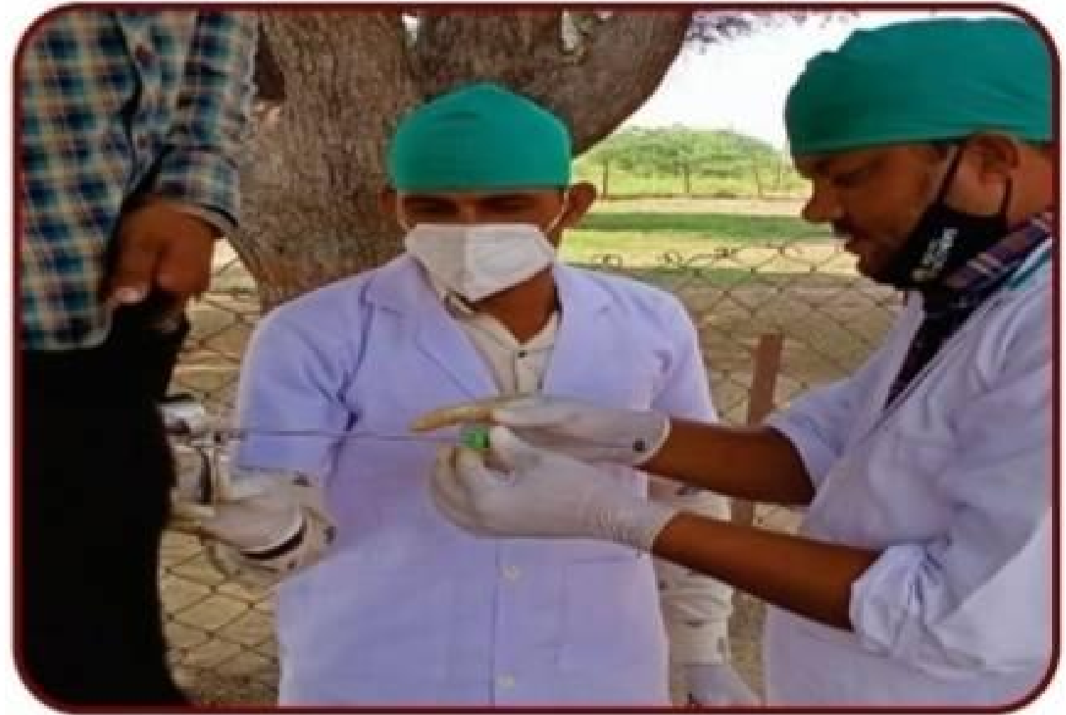
First time Goat A.I. in CSBF, Hisar, 23.5% kidding