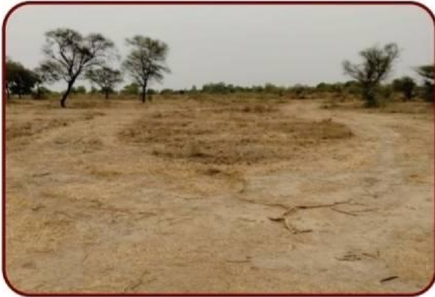
Dry and Sally area jungle cleaning free of cost with revenue earning