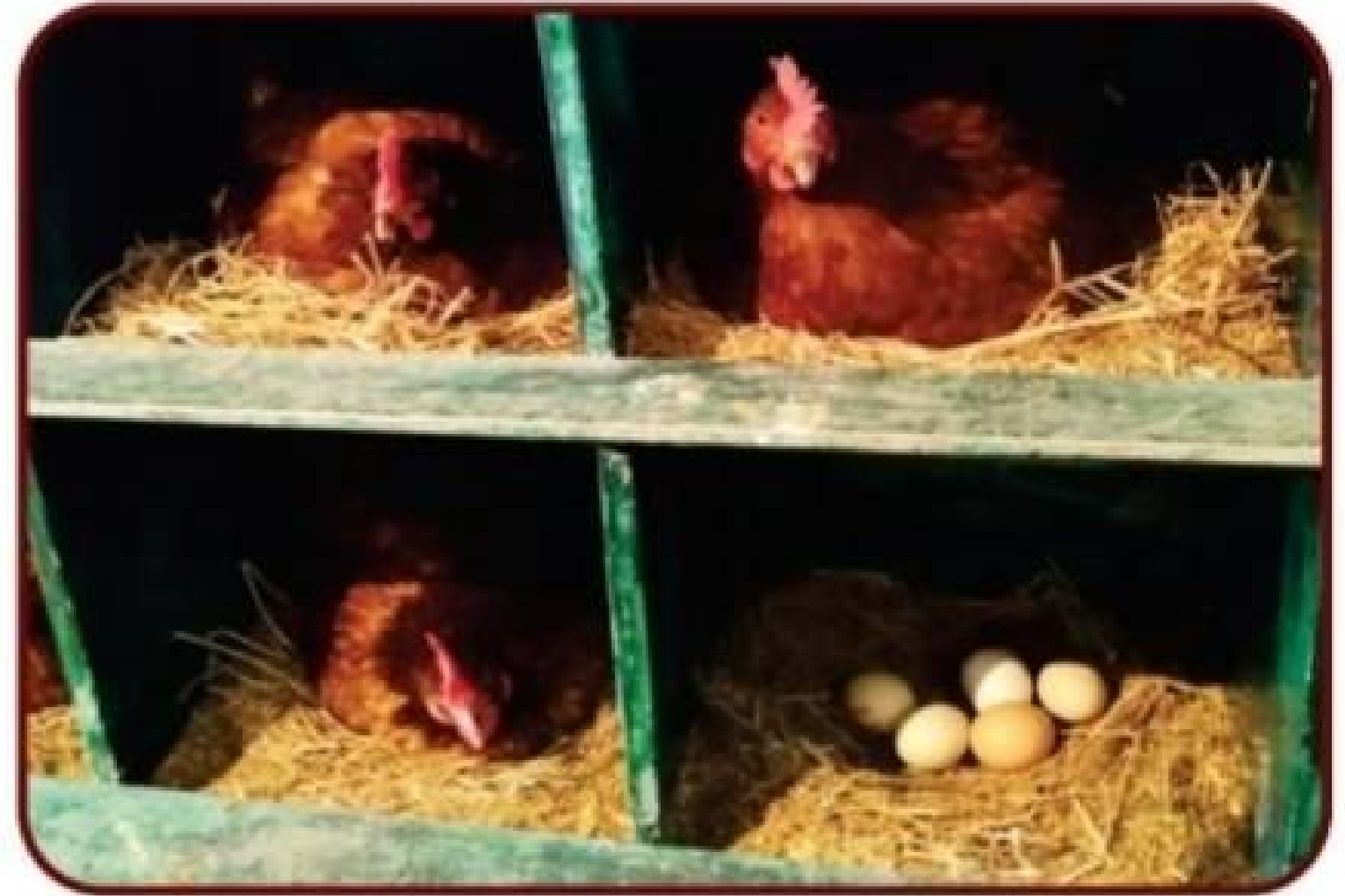
Poultry Under Integrated Pilot Project R.I.R. Breed