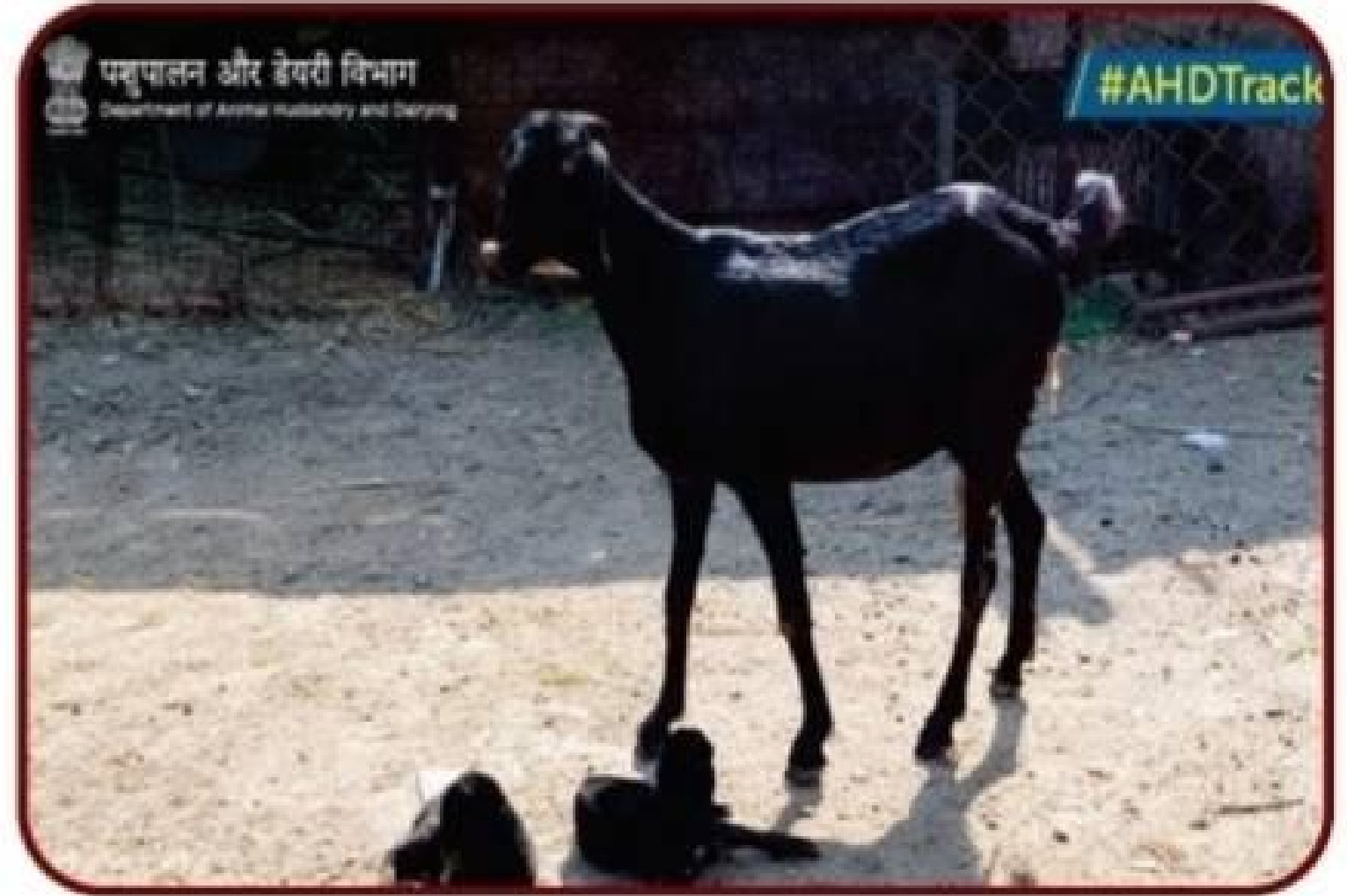
A.I. Born Kids (Twins)