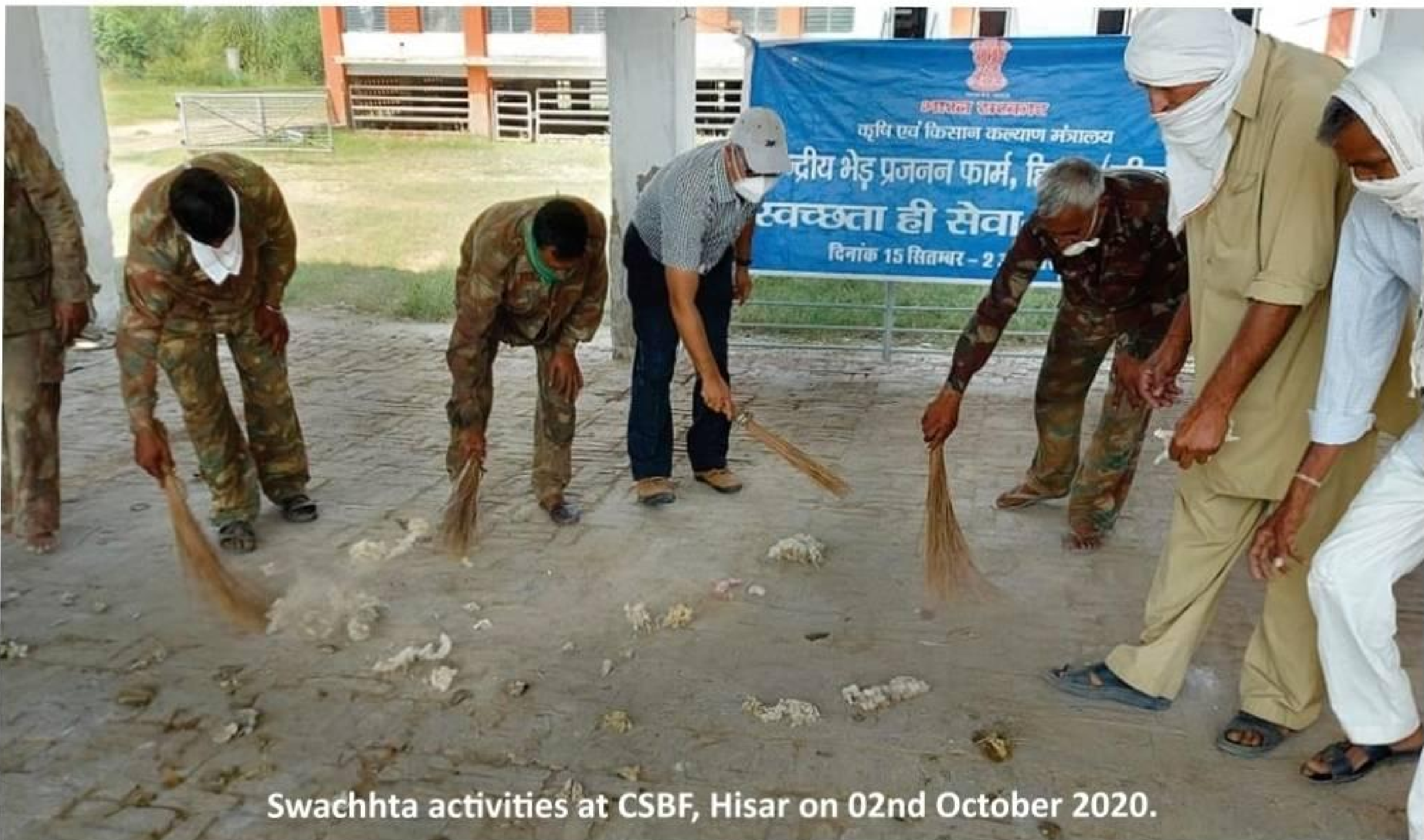
Swachhta activities at CSBF, Hisar on 02nd October 2020.

विश्वविद्यालय के कृषि विज्ञान केंद्र से वर्मी कंपोस्ट, डीकपोज बनाने की प्रक्रिया सीखी। इसे बाद कुछ समय तक लेह में जैविक खाद खुद तैयार कर बेचकर भी कामाई की। इसके बाद भी वह रुके नहीं।