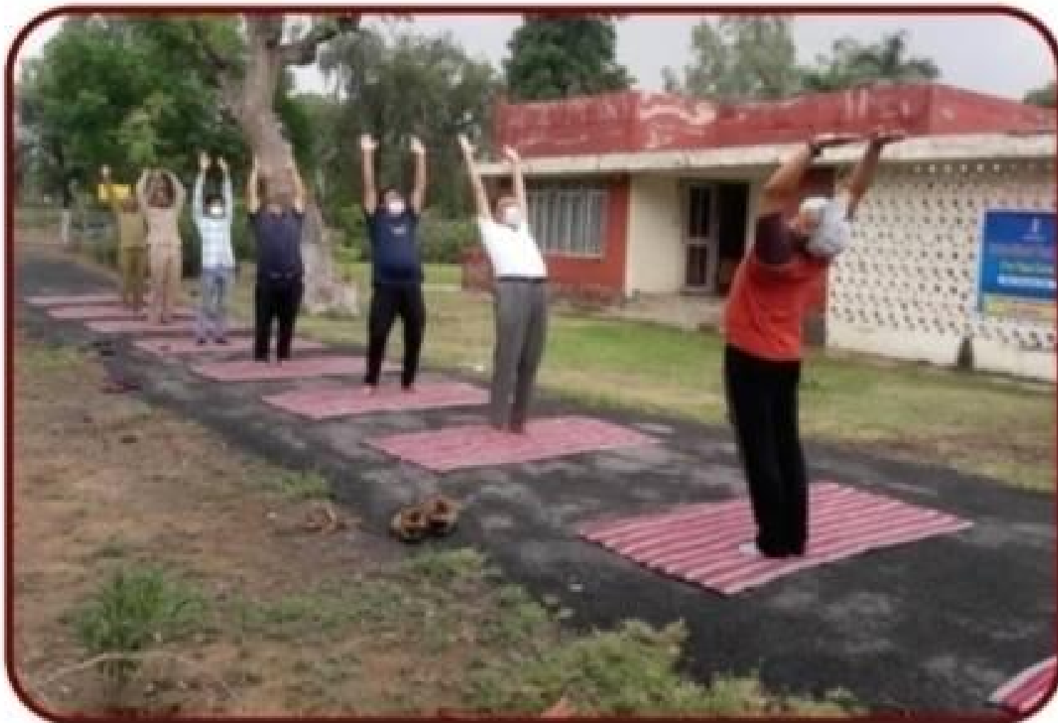
International Yoga Divas on 21st June' 2020 at CSBF, Hisar maintaining social distancing due to COVID-19 pandemic.