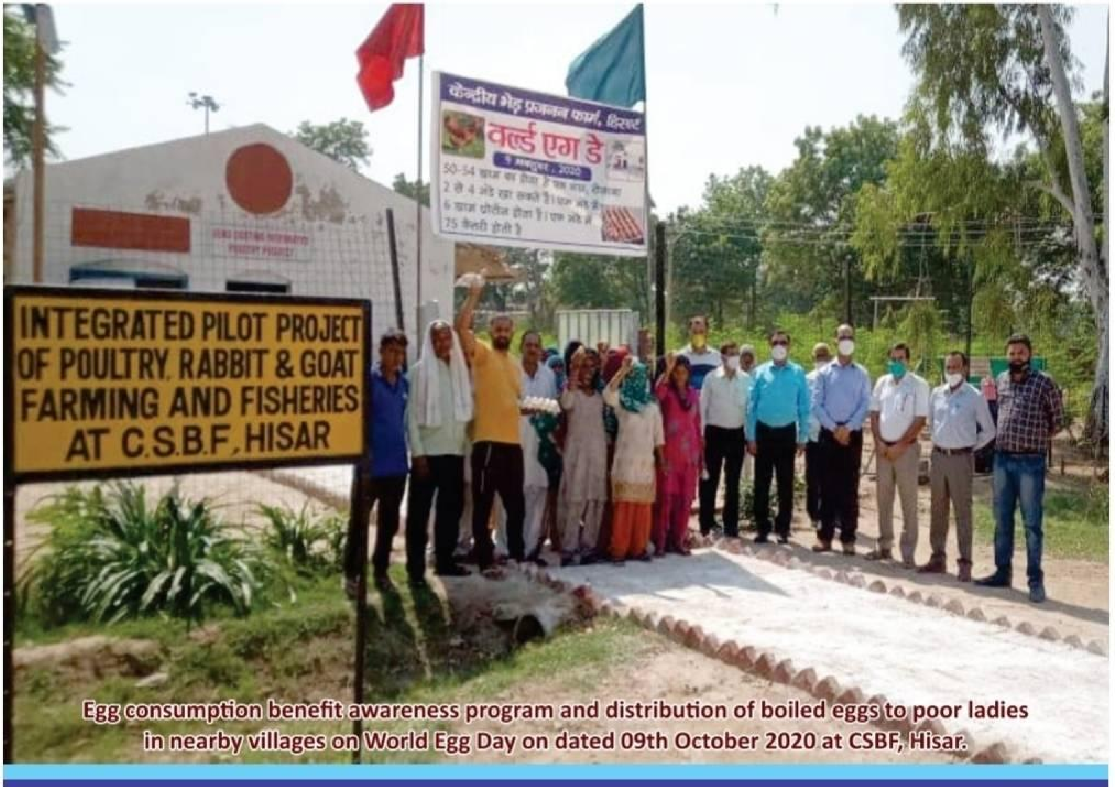
Egg consumption benefit awareness program and distribution of boiled eggs to poor ladies in nearby villages on World Egg Day on dated 09th October 2020 at CSBF, Hisar.

Ministry of Fisheries, Animal Husbandry & Dairying Department of Animal Husbandry & Dairying Government of India