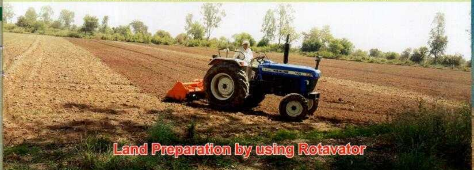
Land Preparation by using Rotavator