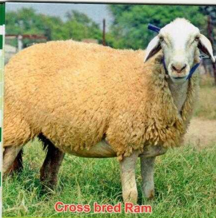
Cross bred Ram