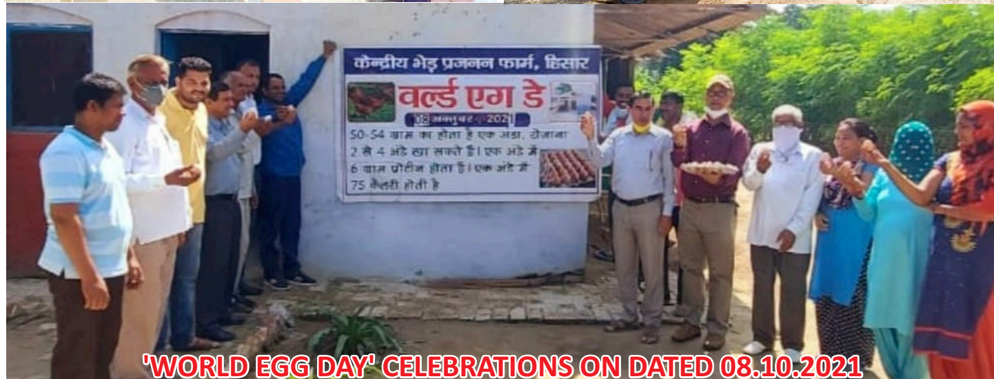
'WORLD EGG DAY' CELEBRATIONS ON DATED 08.10.2021

Ministry of Fisheries, Animal Husbandry & Dairying Department of Animal Husbandry & Dairying Government of India Krishi Bhawan, New Delhi-110001