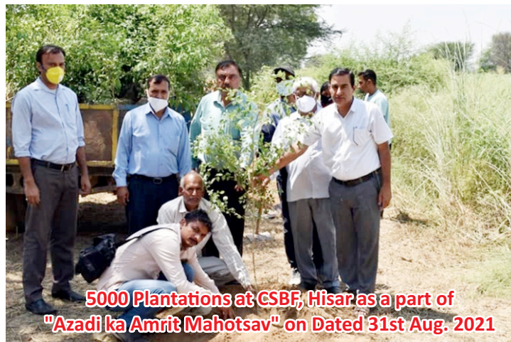
5000 Plantations at CSBF, Hisar as a part of "Azadi ka Amrit Mahotsav" on Dated 31st Aug. 2021