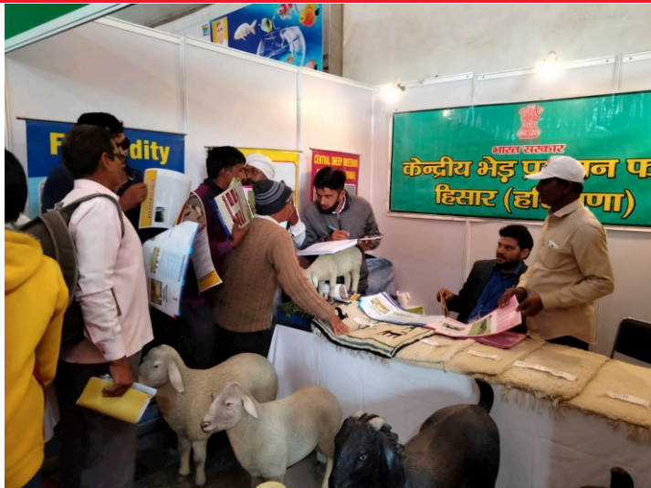
Participation of Central Sheep Breeding Farm, Hisar in "38th State Livestock Show 2022" dated from 25.02.2022 to 27.02.2022 at Bhiwani, Haryana.