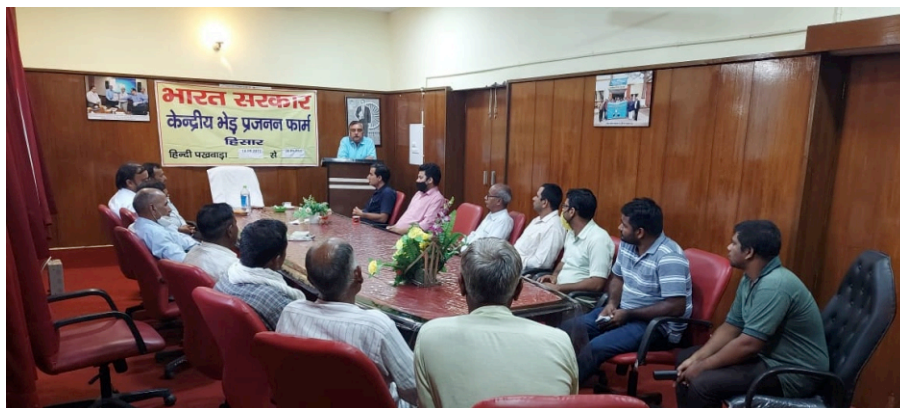
'HINDI PAKHWADA' 14-28 SEPTEMBER' 2021