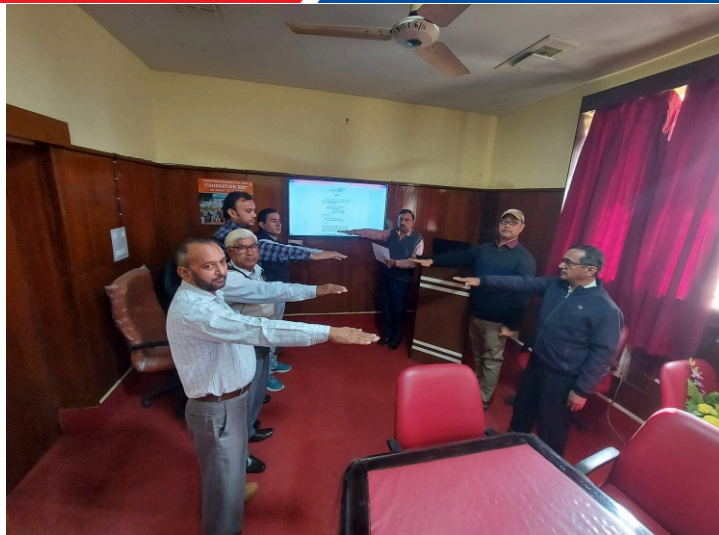
"CONSTITUTIONAL DAY" CELEBRATIONS ON DATED 26.11.2021