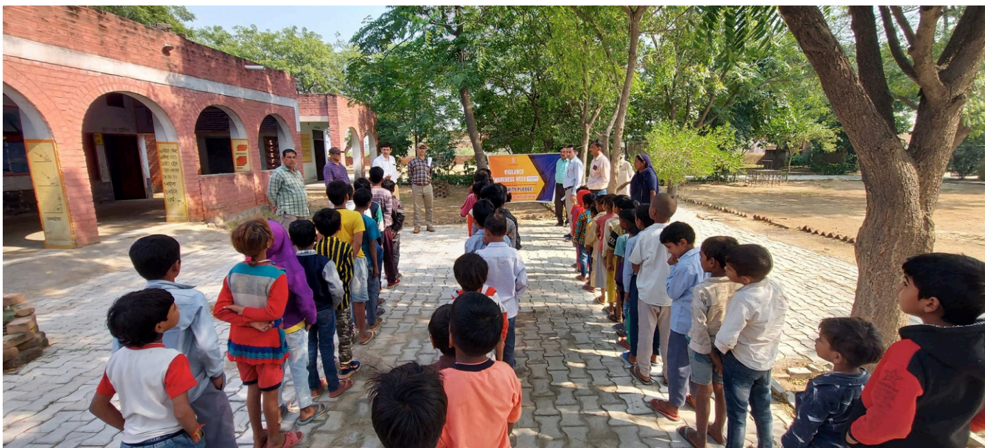
VIGILANCE AWARENESS WEEK(26TH OCTOBER TO 01ST NOVEMBER' 2021)