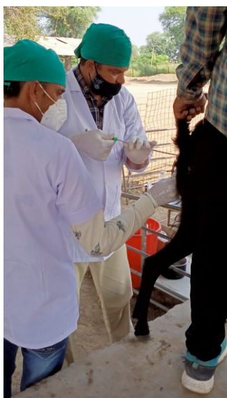
Goat A.I. achieved 33.33% kidding